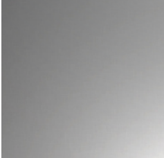
BASE POLISHED ALUMINUM (CD)