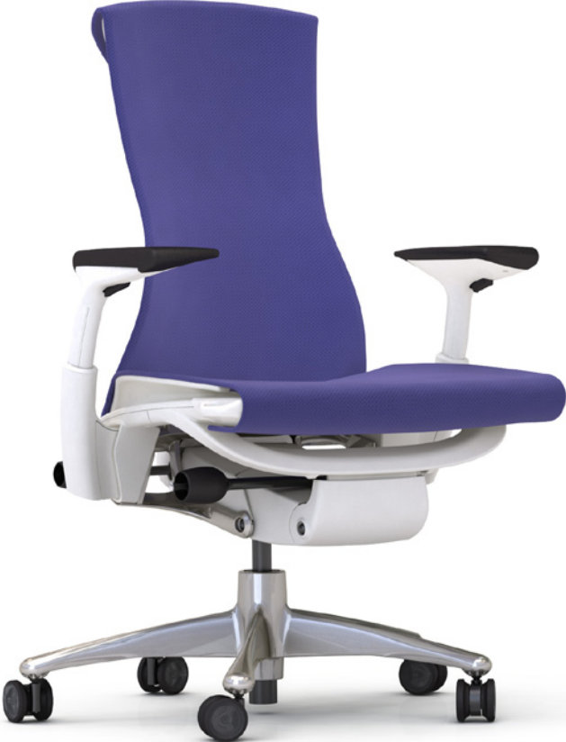
BALANCE TEXTILE IRIS (3510)

The first chair designed to support your body and your mind.